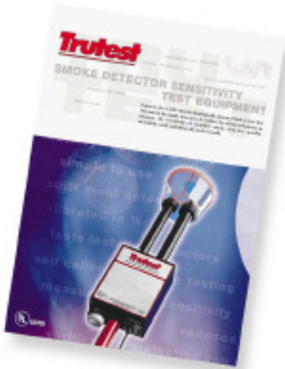
Trutest - Sensitivity Test Equipment