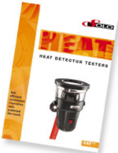
Heat Detector Testers